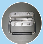
Stainless steel handles