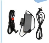
AC adapter VE09001