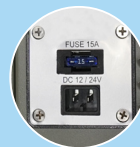
Multi supply 12/24 DC & 220V AC